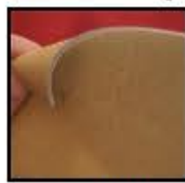
ME Leather Desert Suede

The suede used in our ME boots is a rough-out cowhide leather. Produced and tanned in the U.S., it is what you would expect from America's Premier Bootmakers. Heavy weight for durability, but soft for easy break in and long lasting comfort.