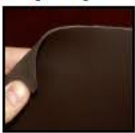
Dark Brown Voyager