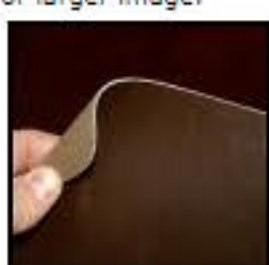
Dk. Brown Calfskin